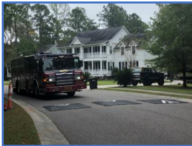
Town of Mount Pleasant adopted speed cushion layout (for town roads)