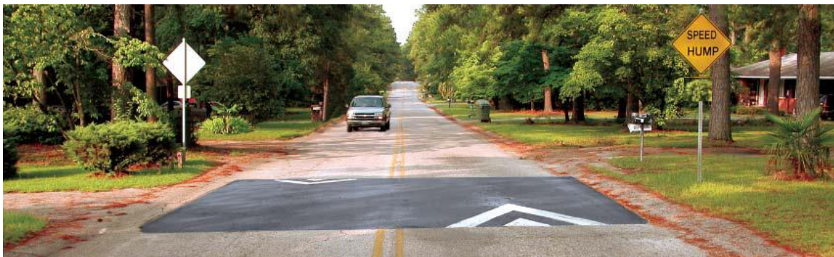
SC Department of Transportation speed hump layout (for state roads)